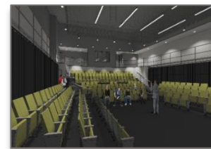
Burbank Theater Studio Image

The design team has met with faculty and staff to select material finishes for the building, as well as seating for both the main 400 seat auditorium and the 200 seat Studio Theater. TLCD/Mark Cavagnero Associates presented the final design and finishes to the Board Facilities Committee on February 7, 2017.